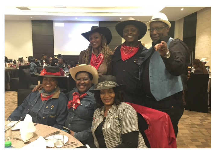
The cowboy and cowgirls - Baby club, Kilimani Alfajiri installation