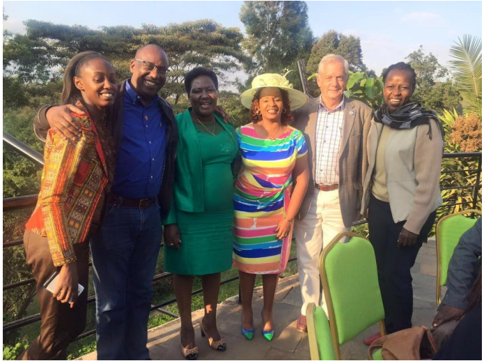
Supporting our baby club, Karengata